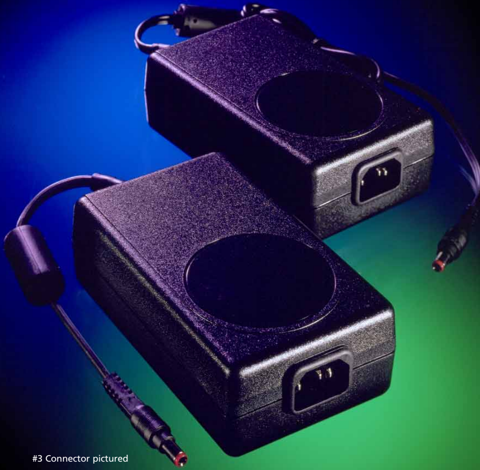
#3 Connector pictured