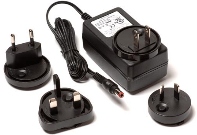
*Photo shows optional blades kit