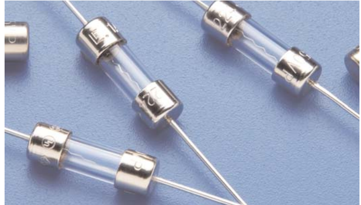
2205 000P Series

Wave solder- 500°F(260°C), 3 seconds Max. Reflow solder- Not recommended